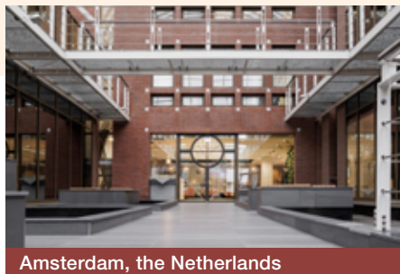
Amsterdam, the Netherlands