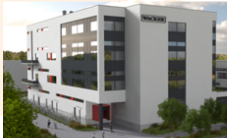
Halle (Saale), Germany