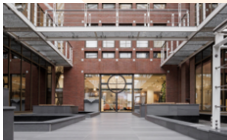
Amsterdam, the Netherlands