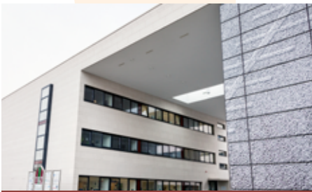
Halle (Saale), Germany