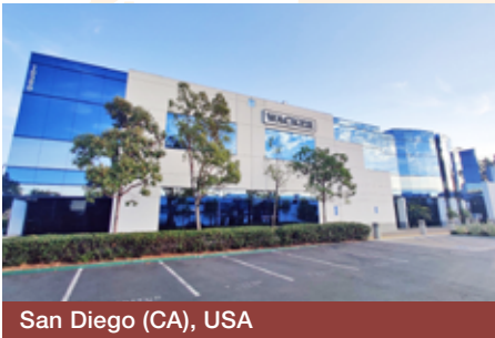
San Diego (CA), USA