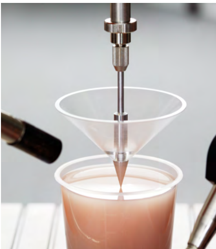
Penetration Test of ELASTOSIL® P grades