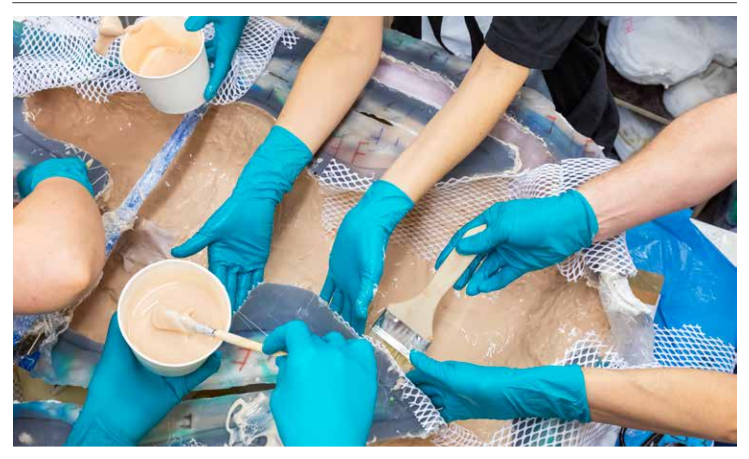
An entire team of makeup artists uses brushes and spatulas to spread the still-liquid silicone over the negative mold.

"ELASTOSIL" FX 20 is ideally suited for extremely lifelike reproductions. It is tailored to produce an optimal combination of stability and softness."