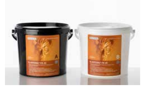
ELASTOSIL® FX 20, one of four WACKER silicone rubber grades specifically created for the special effects sector, is supplied as two components that are mixed just before processing.

usts of all the big names associated with the Munich Kammerspiele, both past and present, stand side by side on the shelves of the theater's makeup and hairstyling workshop: a veritable who's who of German theater, molded and shaped with silicone rubber and plaster of paris. "We need the impressions of the heads of actors in order to make wigs a perfect fit," says Brigitte Frank, head of the makeup and hairstyling department at the Kammerspiele. "Ultimately,