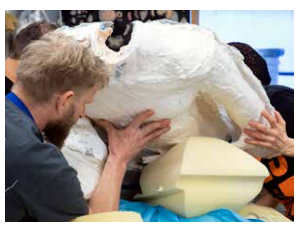
As the negative mold is likewise made of highly elastic silicone rubber, plaster of paris bandages are used to support it.

The first silicone layer cures after six or seven minutes. Two additional layers follow until the flexible rubber is thick enough to make a firm negative mold. "Not a single air bubble has formed," he notes. Now the makeup artists apply