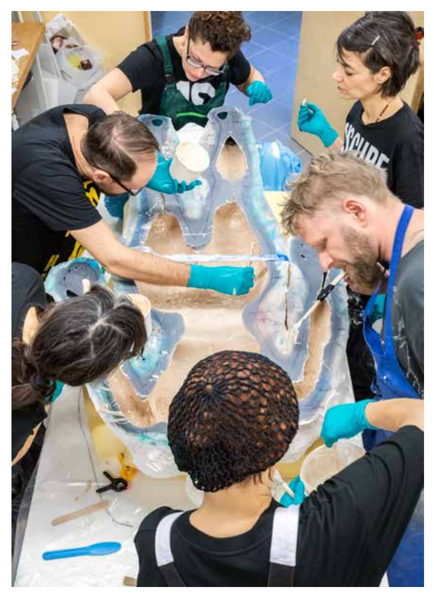
Making the positive copy requires the makeup artists to work very meticulously at top speed. Since the silicone cures in a few minutes, the entire process needs to be performed quickly.