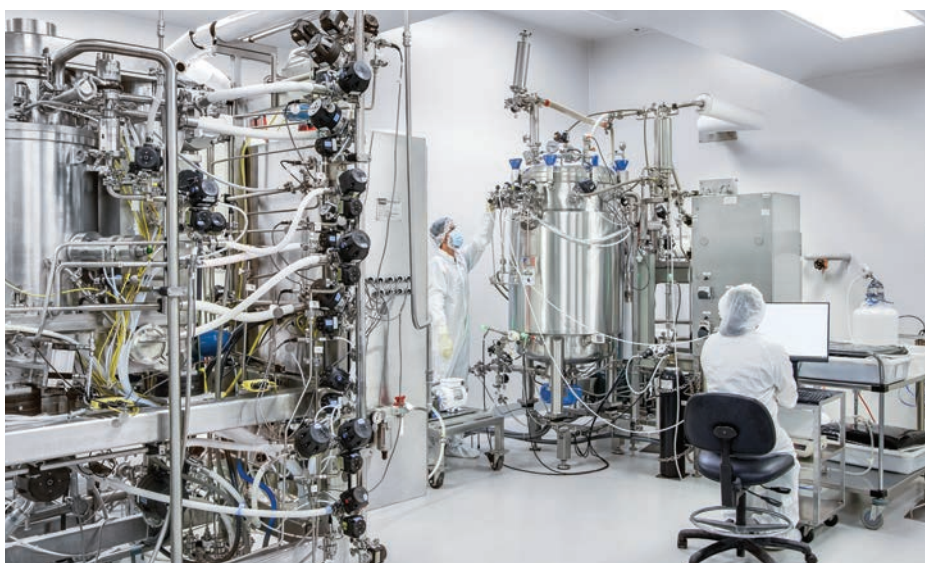
As a CDMO, Wacker Biotech operates a dedicated GMP production facility focusing on pDNA.

The demand for nucleic acid-based gene therapies, novel vaccines, innovative therapeutic agents including messenger RNA (mRNA) and viral vectors is high. Plasmid DNA (pDNA) is the basis for all these advanced therapies. Wacker Biotech's versatile plug-and-play platform PLASMITEC® is based on decades of hands-on experience in pDNA manufacturing for both early stage and Phase 3 clinical trials. A combination of innovative technologies and quality systems, outstanding experience and the ability to efficiently perform GMP (Good Manufacturing Practice) production for both clinical studies and future commercial purposes make Wacker Biotech the partner of choice for contract manufacturing of pDNA.