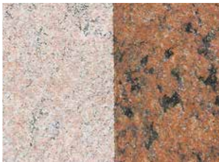
Example of a color-enhancing coating – left: untreated, right: treated.

SILRES® BS 30 can be applied with a cloth, sponge, brush or spray. Depending on the porosity of the surface, one or several layers are applied, usually in undiluted form.