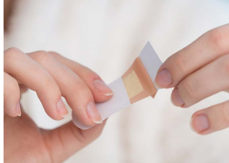
Bandage with release liner

Skin adhesive gels are typically used as part of a system requiring uncompromised adhesion to the backing layer combined with low adhesion to the release liner. Release liners are an essential part of the ultimate product as the applications require proven system performance as a whole.