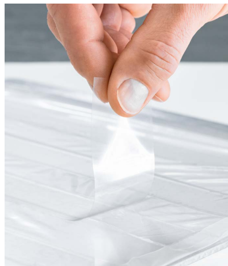
The release liner can easily be removed from the silicone adhesive coating.

combinations of SILPURAN® 2114 adhesive gel in combination with selected Loparex release liners. In all cases, the peel strength remains below 0.5 N/in and is stable over time, thus increasing the shelf life of the end product.