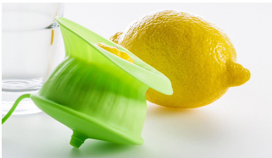
Citric press made from SILMIX® eco R plus TS 40002 based on ELASTOSIL® – a one-component, food-contact-compliant, platinum-curing, solid silicone rubber.